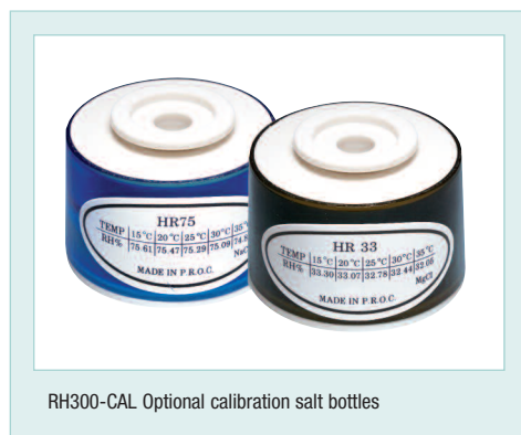
RH300-CAL Optional calibration salt bottles